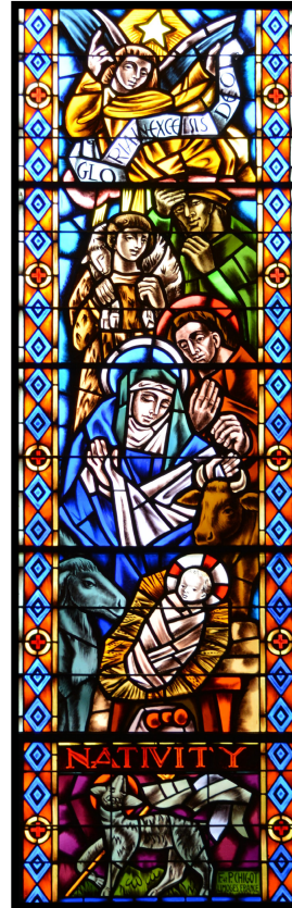
Nativity window, Cathedral (Chigot, 1956)

MONTHLY HOLY HOUR Tuesday, December 17: 6:00 pm